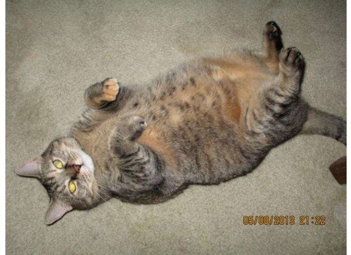
Josie waiting for belly rubs